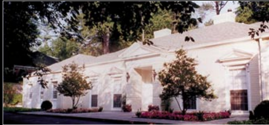
Moore's Mill Road, Atlanta, GA

EXHAUSTO has manufactured chimney fans for more than 40 years.