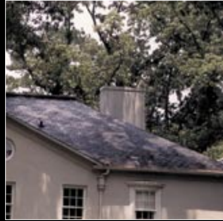
Tuxedo Road, Atlanta, GA