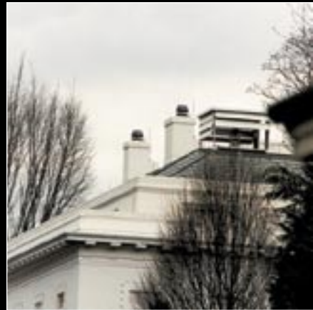
The White House, Washington, DC